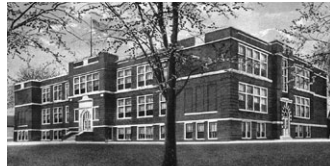
7th Street | 1915-1931