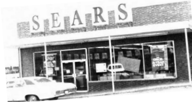
1960s Sears at Five Points