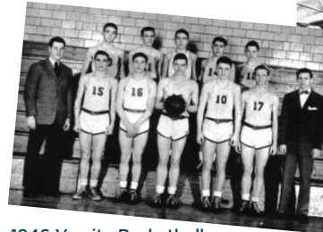
1946 Varsity Basketball