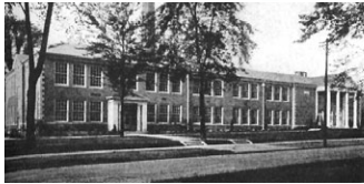
6th Street | 1931-1968