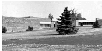
Maple Street | 1968-1990