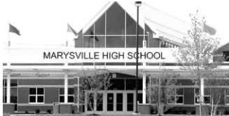
Current | 1990-present