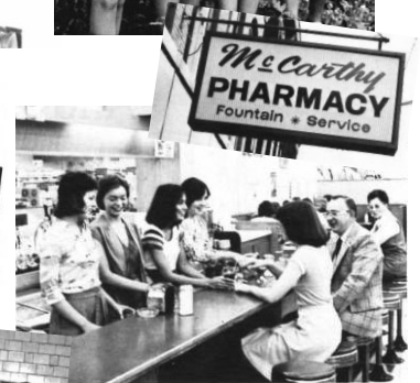
1976 McCarthy Pharmacy