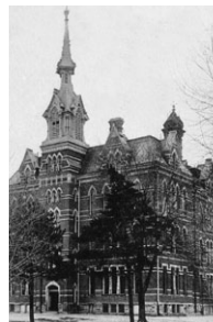
Chestnut Street 1877-1914